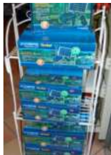
Let the sun pay your bills