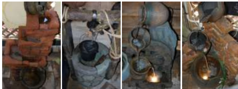
Our exciting new range

Our new range of resin water features are just starting to arrive. These strong but lightweight units are very easy to assemble and come with pumps and tubing so you just have to add the water! They look great on the patio, in a courtyard or in the garden and the sound of water really creates a relaxing mood especially near an entertainment area. We have a few set up and running already around the main building.