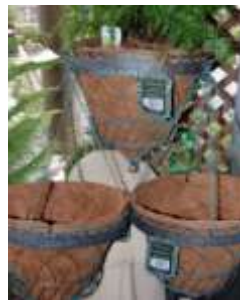
Ye olde baskets

We've recently been stocking the Victorian Hanger Cones which have proved to be rather popular. These decorative wire baskets are deeper than most to allow for better root growth. They come complete with co-co liner, are 35cm in diameter and retail for $42.99.