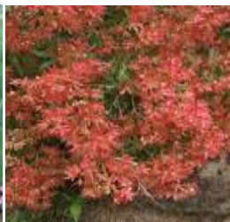
NSW Xmas Bush