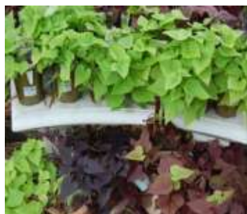
A leafy groundcover

If you're after an eye catching groundcover with a difference Ipomea "Sun Kisses" might be just the thing. They come in three colours, a light green, dark purple and red. They form a dense cover of about 1.5m wide and will cascade over retaining walls, pots or hanging baskets. Quite hardy once established these Kisses will do well in full sun to part shade. In a 140mm pot they are $12.99.